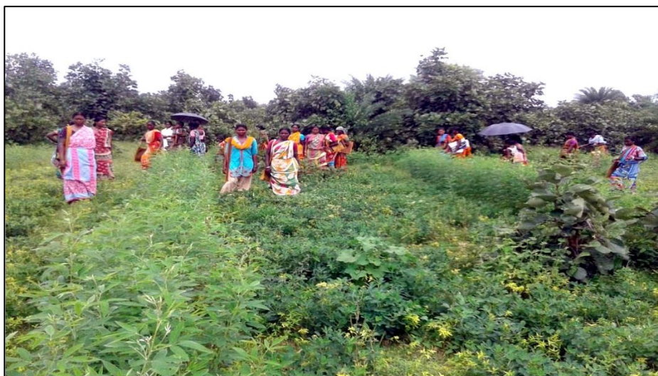
The women of Marangburu Mahila Dal and Jaher Ayu Mahila Dal in the Mixed Cropping land